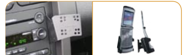
Optional components for a Bluetooth car-kit